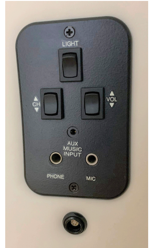
Individual Controls and Bose Heaset Plugs in Rear Cabin